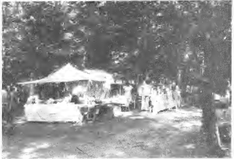
A TYPICAL BOOTH AT THE OAK GROVE COUNTRY FAIR

An excellent resource for youth and youth groups is "Youth Magazine," an award winning publication of the United Church of Christ. Published monthly, each issue contains provocative stories about faith and lifestyles written in language and with a format attractive to youth. Comics and contests in which youth can participate also enhance the magazine. Subscription information can be secured by writing to "Youth Magazine," 1505 Race Street, Philadelphia, PA 19102.